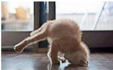
Yikes! Front brakes locked up again!

Don't wait until your brakes make funny noises, start grinding or pedal starts pulsating to have them inspected. Worn brake pads or other braking components can result in longer stopping distances, which is a safety concern.